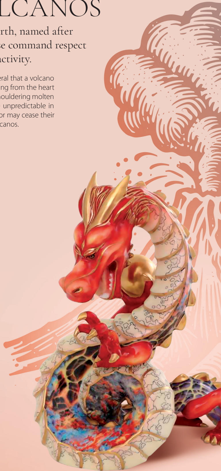
Whirlwind dragon (limited edition) 16154000SP774

The only volcano in continental Europe to have erupted in the past one hundred years. It is also the most dangerous one, as three million people live in its vicinity – with a minimum of six hundred thousand of them in the danger zone. Located in the south of Italy, Mount Vesuvius would also be an apt candidate for the title of the best known volcano in the world: the story of Pompeii, which was buried under ash by the formidable volcano of the Gulf of Naples in 79 AD, made it to everyone’s history textbook. And that is precisely why the volcano is a thriving tourist attraction.