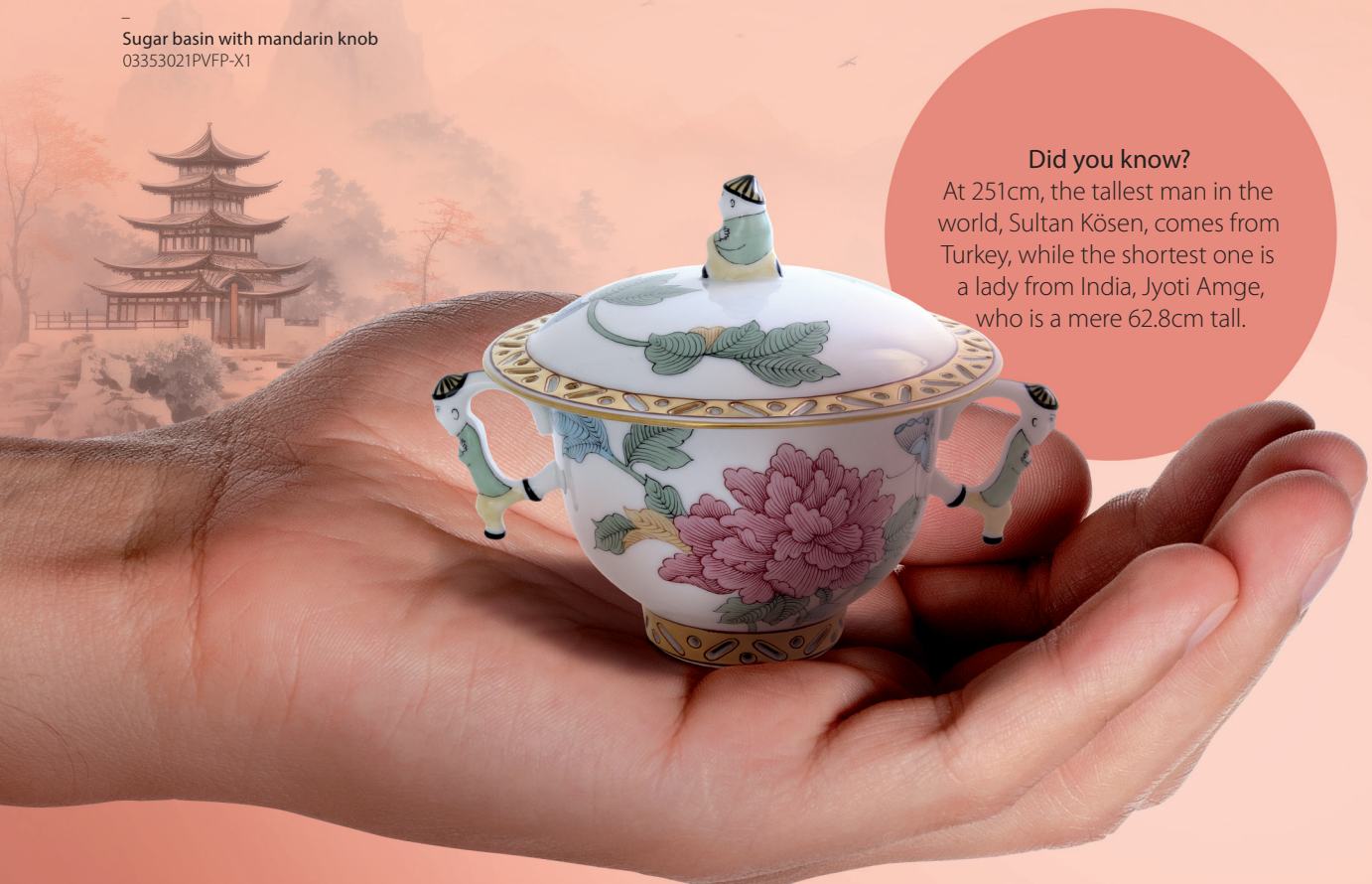
– Sugar basin with mandarin knob 03353021PVFP-X1

The tallest skeleton ever discovered in prehistoric China was also unearthed in this province: the young man presumed to be between sixteen and eighteen years of age, who, over four thousand years ago, may have been 193cm tall, has been dubbed the “Longshan Giant”. Moreover, Confucius, one of the most outstanding sages in eastern culture, also comes from the Province of Shandong, and his extraordinary height is mentioned in multiple books. Born in 551 BC, the philosopher was at least 189cm tall.