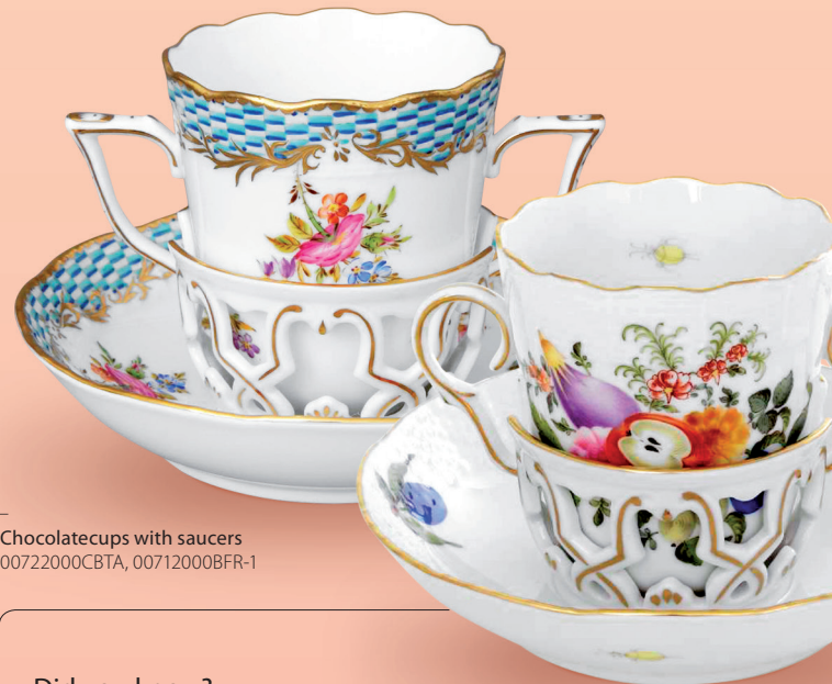
Chocolatecups with saucers 00722000CBTA, 00712000BFR-1

The best option for those less privileged in the 19th century was a passenger vehicle called omnibus: also drawn by horses, it accommodated many more passengers (eight to fourteen) which is why it is considered a forerunner of autobuses and trolleybuses and a pioneer in public transport. Omnibus tickets were bought mainly by shopkeepers, clerks, craftsmen, and white-collar workers. The first omnibus in Budapest was launched on 1 July 1832, while the last service to transport passengers in Budapest ran on 30 April 1929.